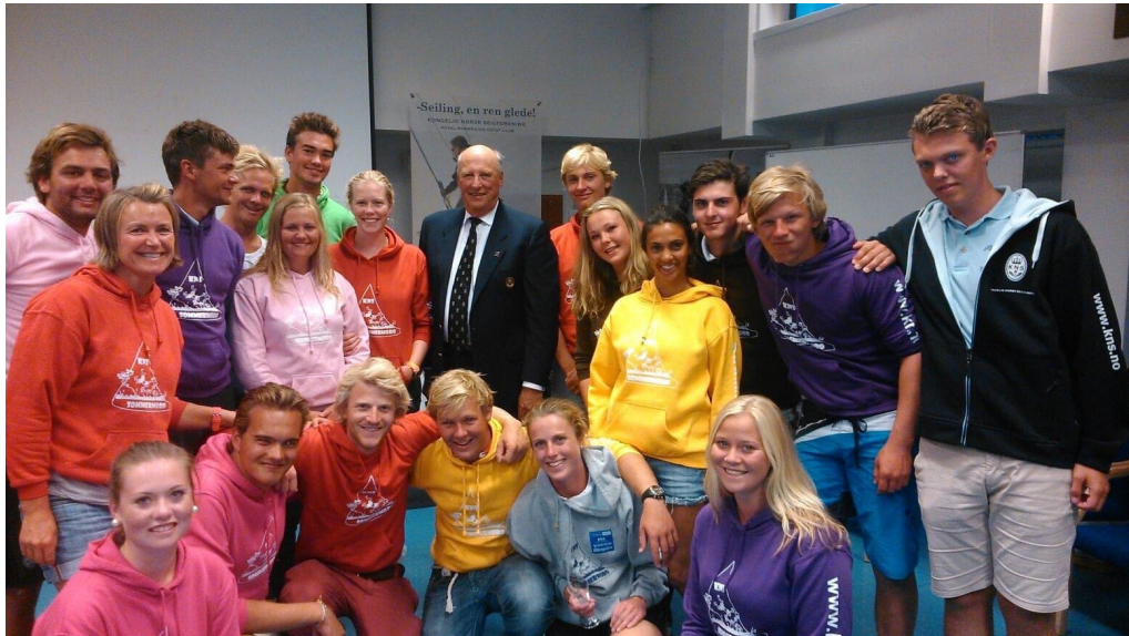
The King of Norway with young sailors, many are former Five Club participants